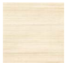
CMO FAB II 01 A