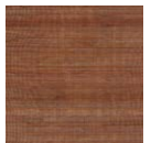
CMO FAB II 70 A