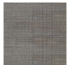
CMO FAB II 82 A