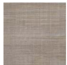
CMO FAB II 84 A