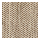
CMO APL 02 03