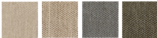
CMO APL 02 01