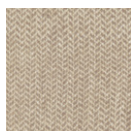
CMO APL 02 01