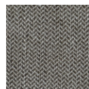
CMO APL 02 04