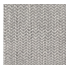
CMO APL 02 02