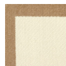
CMO APL 03 04