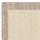
CMO APL 03 01