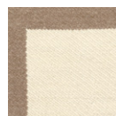
CMO APL 03 03