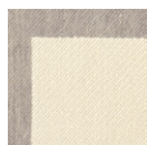
CMO APL 03 02