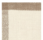
CMO APL 04 02