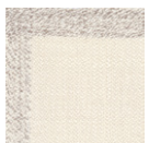
CMO APL 04 01