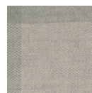
CMO APL 04 05