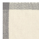
CMO APL 04 04