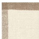
CMO APL 04 02