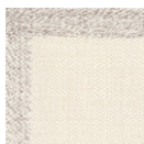
CMO APL 04 01