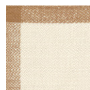
CMO APL 04 03