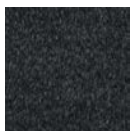
CMO FAL 01 81