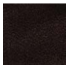
CMO FAL 01 70