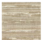
CMO FLA 04 01