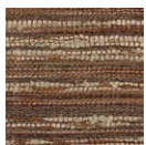
CMO FLA 04 70