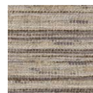
CMO FLA 04 81