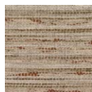
CMO FLA 04 73