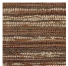
CMO FLA 04 70