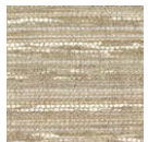
CMO FLA 04 01