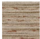
CMO FLA 04 73