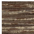
CMO FLA 04 78