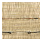
CMO FRA 10 10