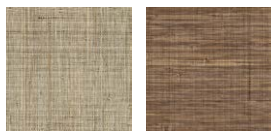
CMO FRA 23 01