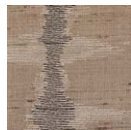
CMO FSO 05 86