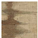
CMO FSO 05 78