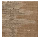
CMO FSO 05 70