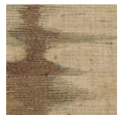
CMO FSO 05 78