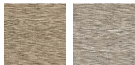
CMO FSO 06 70