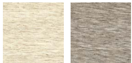
CMO FSO 06 01