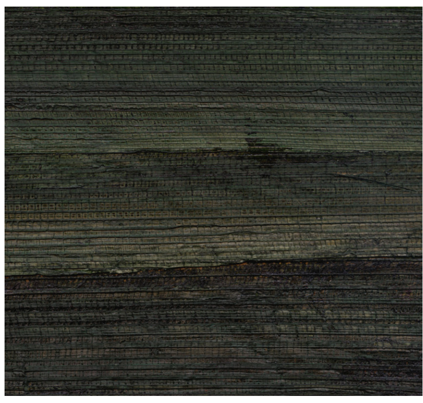
ALL AVAILABLE COLORS