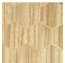
CMO WBO 03 20