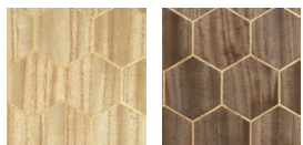
CMO WBO 03 20 CMO WBO 03 70