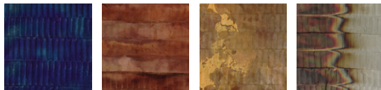
CMO WME 01 49 CMO WME 01 70 CMO WME 01 92 CMO WME 01 95