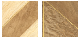
CMO WMU 03 15 CMO WMU 03 70