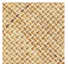
CMO WPA 04 71