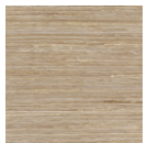
CMO WRM 01 15