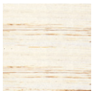
CMO WRM 01 01