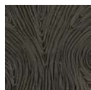
CMO FEX 01 70