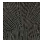
CMO FEX 01 82