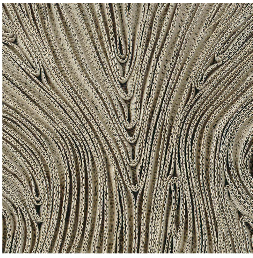
ALL AVAILABLE COLORS