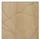
CMO WCA 01 15