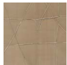
CMO WCA 01 20