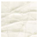
CMO WCA 01 02