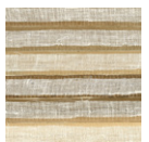
CMO WPN 01 10