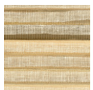
CMO WPN 01 01