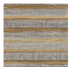
CMO WPN 01 86