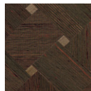
CMO WSO 03 68