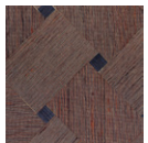
CMO WSO 03 48