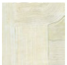
CMO WCA 03 02