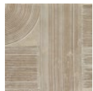
CMO WCA 03 88