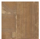
CMO WCA 03 20