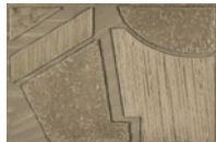
CMO WCA 05 20 A