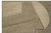
CMO WCA 05 20 B