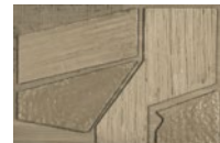
CMO WCA 05 20 D