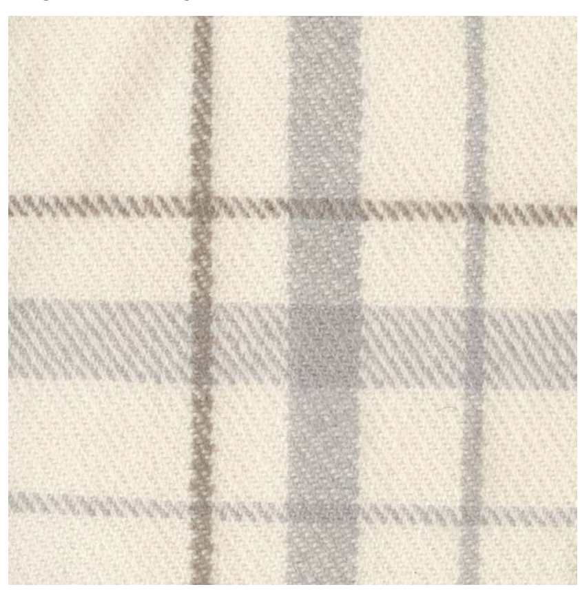
ALL AVAILABLE COLORS