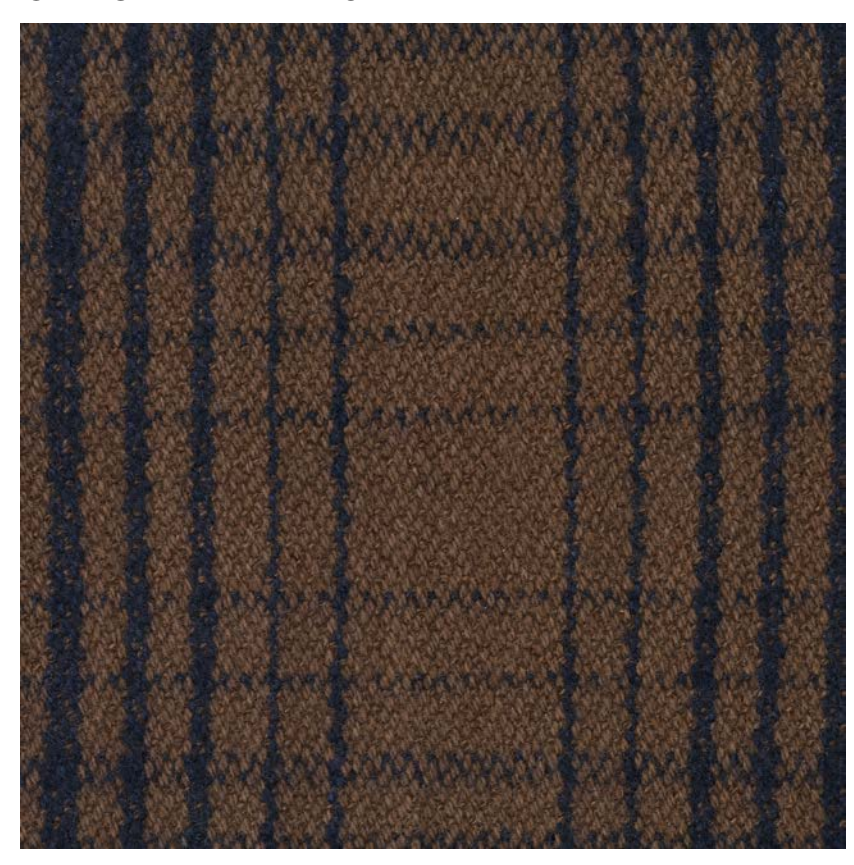
ALL AVAILABLE COLORS