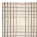
CMO APL 06 03