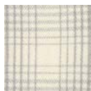
CMO APL 06 01