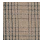
CMO APL 06 05