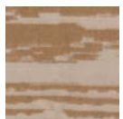
CMO APL 07 72