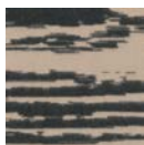
CMO APL 07 80