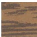
CMO APL 07 75