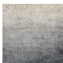
CMO ATA 07 82