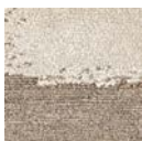
CMO ATA I2 10