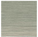
CMO FAL 03 49