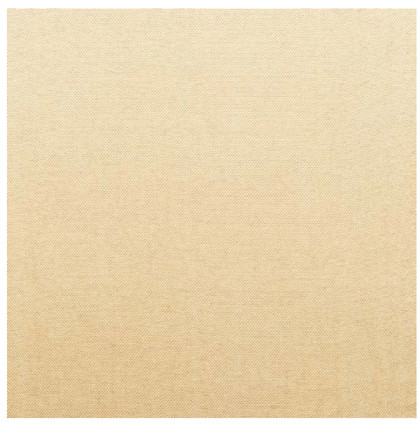
ALL AVAILABLE COLORS