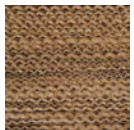
CMO WAB 08 75