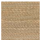
CMO WAB 08 20