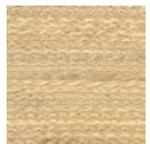
CMO WAB 08 01