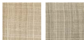
CMO WAB 09 72 CMO WAB 09 80