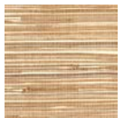
CMO WAB 10 20