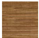
CMO WAB 10 72