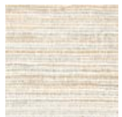
CMO WAB 10 01