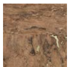
CMO WLI 04 10