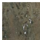
CMO WLI 04 69