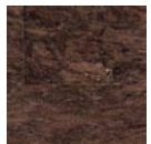
CMO WLI 05 75