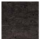
CMO WLI 05 79