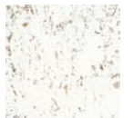
CMO WLI 05 01