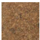
CMO WLI 06 72