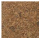
CMO WLI 06 72