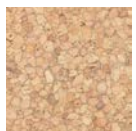
CMO WLI 06 10