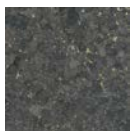
CMO WLI 06 69